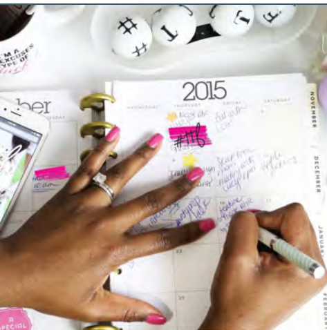
7. The app is really neat! It will create reminders with a simple calendar when users photograph their planning pages. It recognizes dates and times so all users have to do is confirm them!