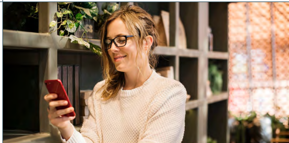
8. Secondary users (The Untiring Mothers) will rejoice because they now have the complete hybridized experience that they need.