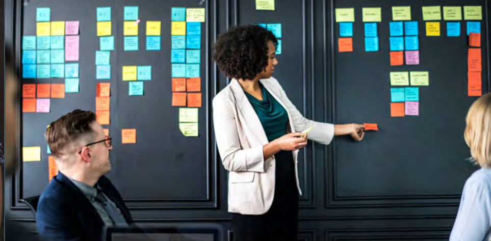
6. After the initial launch, we'll explore the opportunity for a mobile companion app! It will particularly interest secondary users who use their cell phones for reminders.