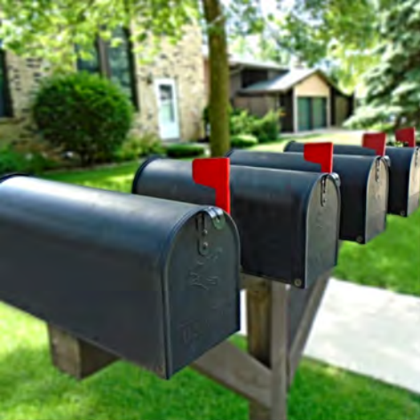
5. Primary users happily receive their planners in the mail and begin using them! Secondary users will also enjoy their totally customized planners, but are still missing a little something special...